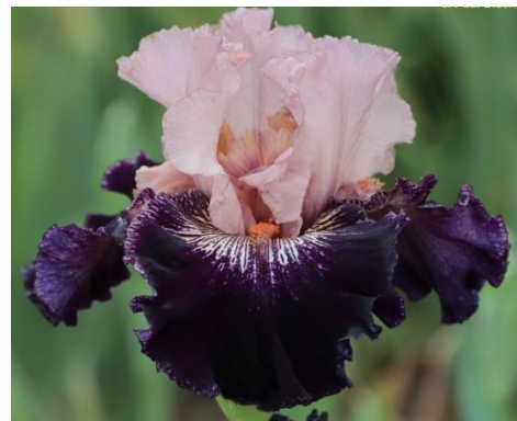
GIRLS WANNA HAVE FUN (Black 2022) TB, 35", M-L. Standards light pink; falls cream to white haft encompassing beard, lined black and sanded mid purple between lines ending in white darts terminating in lower 3/4 purple black, fine white dotted rim; beards mid creamy tangerine; pronounced sweet fragrance.