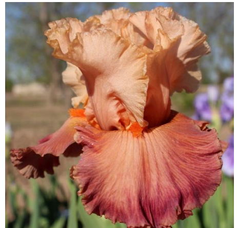
ITALIAN SUMMER (Dash 2022) TB, 33", M. Standards peachy pink, faint rim; falls ruby red on peachy pink zone around beard; beards orange; slight fragrance.