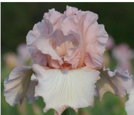
ISLAND BLUSH (Schreiner 2024) TB, 40", M. Standards pink; style arms pink; falls pink; beards orange; tinted foliage; slight fragrance.