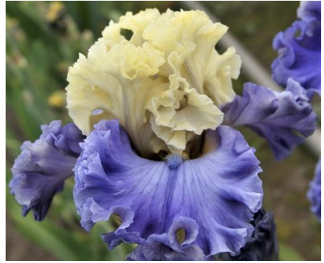
EMBELLISHED (Keppel 2023) TB, 35", L. Standards oyster to marguerite yellow faint lavender shading deeper on reverse side; falls abbey violet, edge slightly paler, extreme ruffling; beards cadmium yellow in throat, chrome yellow with blue base in middle, ends blue.