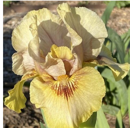
OTERO MESA (Dash 2024) AB, 20", E. Standards beige, light yellow veining; style arms light yellow; falls light yellow overlaid on beige base, light yellow rim; diffuse brown signal; beards light orange.