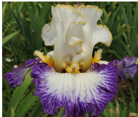
GILTY (Sutton 2022) TB, 34", M-L, SA. Standards white, thin gold rim; falls white, blending into violet blue 3/4 way down petal; beards orange in throat and middle, ends yellow-orange, fuzzy 1" yellow-orange horns.