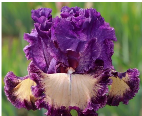
WILD ABOUT YOU (Black 2024) TB, 33", M. Standards light pink ground, wide mid mulberry plicata band, midrib and sanded center; falls light buff pink, mid red-purple plicata band and hafts; beards white base, tangerine tips; pronounced sweet fragrance.