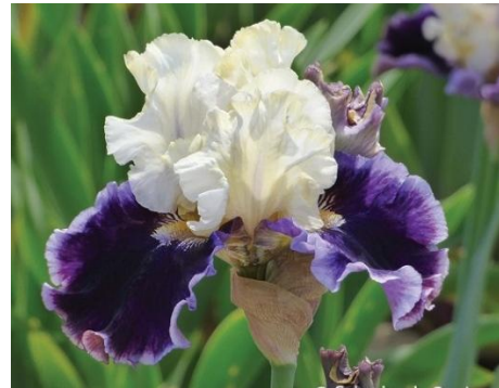
VIKES (Schreiner 2022) TB, 38", M. Standards yellow-cream; falls deep purple, lighter rim; beards orange; slight fragrance.