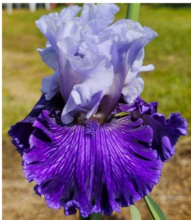
STREAKING SKIES (Tasco 2024) TB, 41", L. Standards pale blue, changing to white; falls dark blue-violet, with veining; beards gold throat, grey middle, grey end; absent fragrance.

(Iris photos and descriptions are courtesy of commercial hybridizers and wiki.irises.org .)