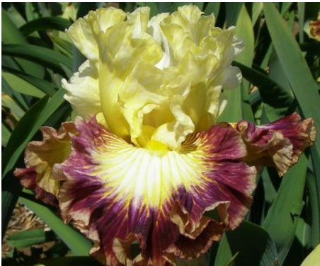
BURST OF SUNSHINE (Sutton 2022) TB, 35", M. Standards palest cream, heavily flushed and veined yellow; falls white zone around beard veined yellow blending into plum halfway down petal, 1/4" greyed yellow band, plum wire rim; beards yellow; ruffled.