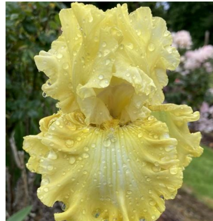
VENETIAN GOLD (Filardi 2022) TB, 32", EM. Standards and style arms golden yellow; falls golden yellow, lighter area in center; beards golden yellow; heavily ruffled; slight spicy fragrance.