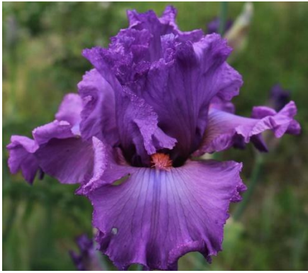
VISION OF LOVELY (Aitken 2023) BB , 24", M. Standards rich lavender-pink; style arms rich lavender-pink; falls rich lavender-pink; beards soft orange; slight fragrance.