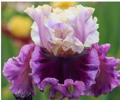
FOR THE AGES (Johnson 2024) TB, 36" M. Standards light violet, flushed deeper with buff rim; style arms buff, violet lined crests; falls rich deep violet, wide medium lavender band; beards purple base, orange tips; sweet fragrance.